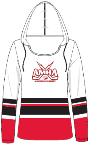
Sideline Lace Lucy