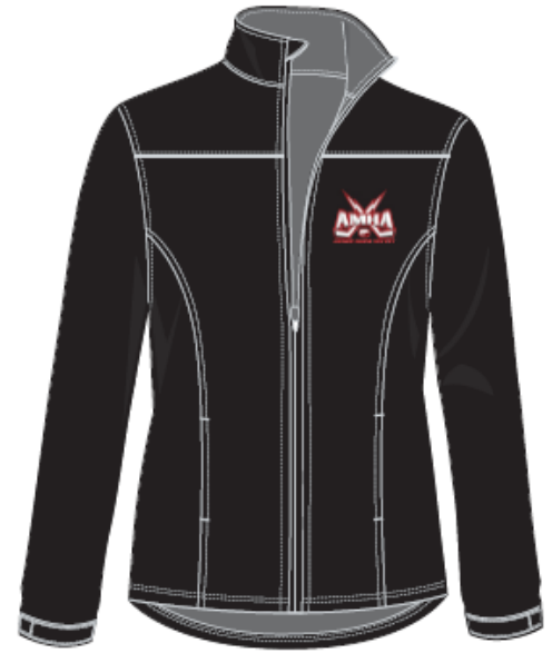
Whirlwind Jacket (Female)