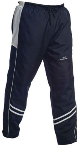
Track Suit KEWL Track Suit: MASCOT Black with White Accents ONLY NO RED OR ACCENT COLOURS comes in youth, men's and ladies styles Regular AA or AMHA Logo Embroidery found in the guidelines

Additional AMHA TRACK SUIT OPTION COMING SOON!