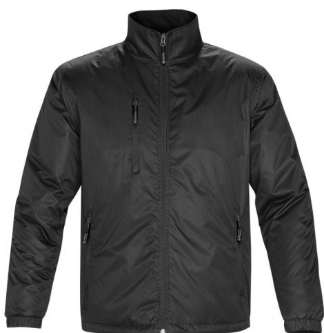
Stormtech Axis Thermal Jacket

Teams who deviate from these apparel guidelines will not be issued travel permits and will be asked to remove our AMHA logo from any unauthorized apparel.