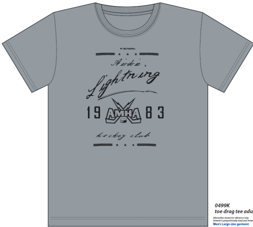
Toe Drag Tee

0499K Toe drag tee adult Wholesale. Short sleeve only. Minimum quantity: 100 units. Order in Men's Large size garment.