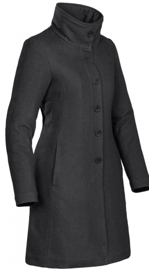
Lexington Wool Jacket STORMTECH Men's and Women's

AMHA or AA Logo in Monotone Embroidered with Charcoal thread only on this jacket. Placement of logo to follow standard logo placement guidelines